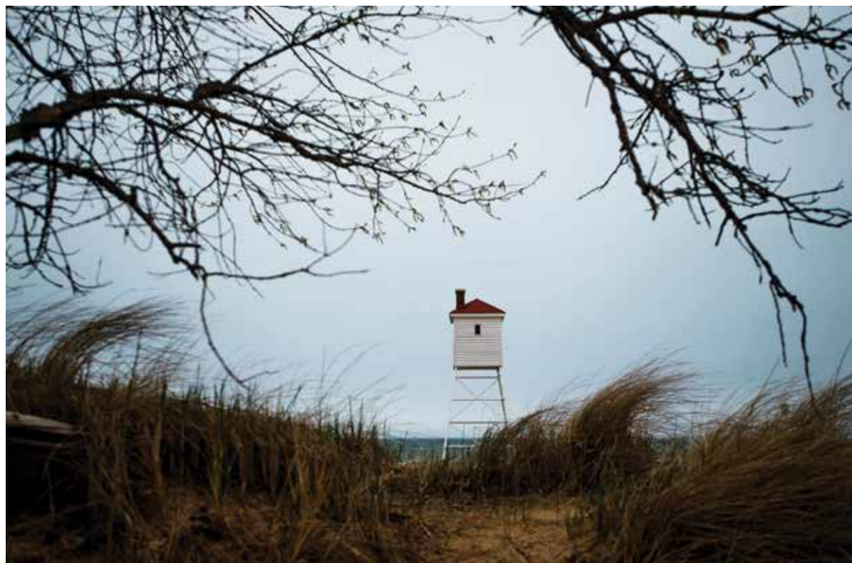
Above: Susan Hamminga peeks out a window at Big Sable Point Lighthouse and enjoys the view. Left: This small structure houses the diaphone horn.