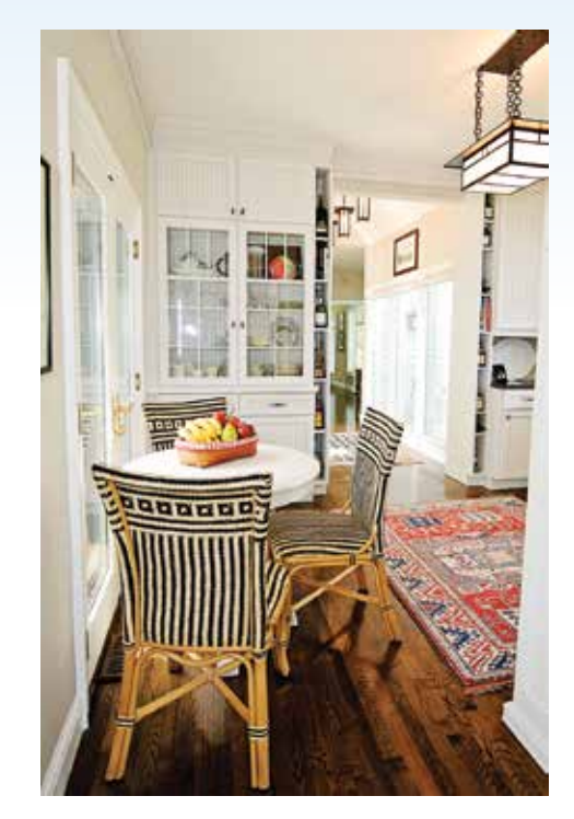
Top: The lighthouse has a modern kitchen complete with granite countertops. Left: An attractive window dining space provides a nice view. Below: The living room looks out on a deck and natural scenery.

"It was definitely a labor of love for them. He just loved to take things and make them to the best they could possibly be. That was my dad's gift. He could see it. He could envision it, and he could do it." — Libby Dinwiddie