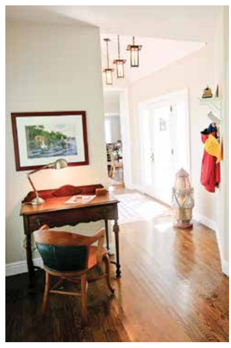
Georgeann Lindberg, an interior designer, opted for a contemporary look with traditional elements and antiques, an open-air floor plan and highquality furnishings from oriental rugs to leather couches.

The island's outdoor space features lush gardens and flowers, coniferous and birch trees, and more than 30 species of birds. They also added walking paths on the island, where Georgeann enjoys taking in the island's natural beauty and solitude.