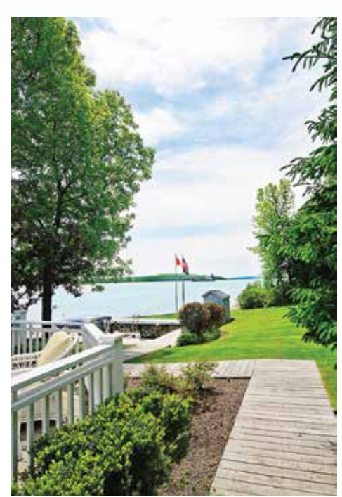
Above: More than 1,000 rocks were moved to create a boat well and stone terraces, garden walls and walking paths. The property was landscaped to accentuate the island's natural beauty.

"It's so beautiful, not only the paths, but the ships that come by. I still go out on the porch with a glass of wine and a good book, and I'm in heaven." — Georgeann Lindberg