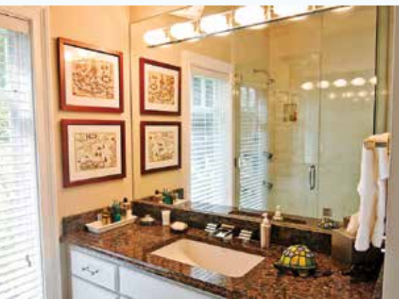
Top: Large windows allow daylight to fill the bedroom. Middle: A modern bathroom and lighting add comfort appeal. Right: A view of the St Marys River from behind the lighthouse.

She says it has a spiritual quality, especially when moss gives life to the rocky paths and everything turns green in the spring.